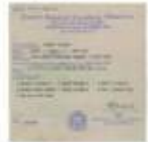
Date Of Birth Certificate